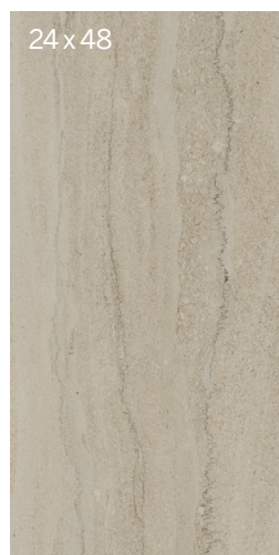
24 x 48