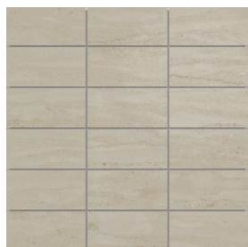
2 x 4 Stacked Mosaics Mounted on a 296.9 x 296.9 sheet (available in all colors)