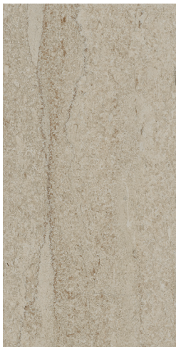
PDC02 ▶ Bluff