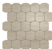
11 x 11 Barrel Mosaics Mounted on a 268 x 270 sheet