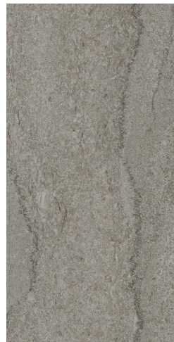
PDC04 ▶ Ashlar