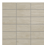
2 x 4 Stacked Mosaics Mounted on a 296.9 x 296.9 sheet