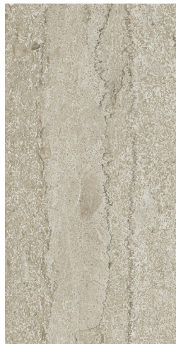
PDC01 ▶ Sheer