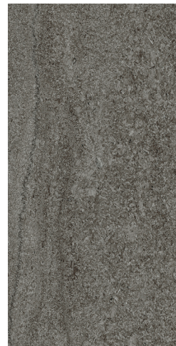
PDC05 ▶ Cavern