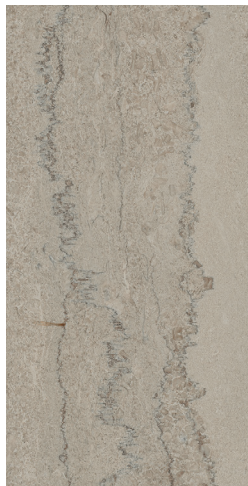
PDC03 ▶ Echo