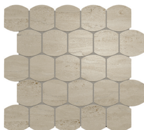
11 x 11 Barrel Mosaics Mounted on a 268 x 270 sheet (available in all colors)