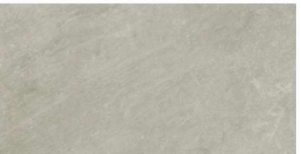
PTG03 ► Venho Verde