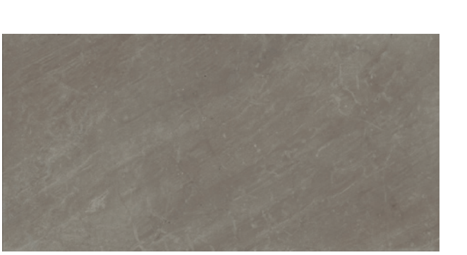
PTG05 ► Harvest Tawny