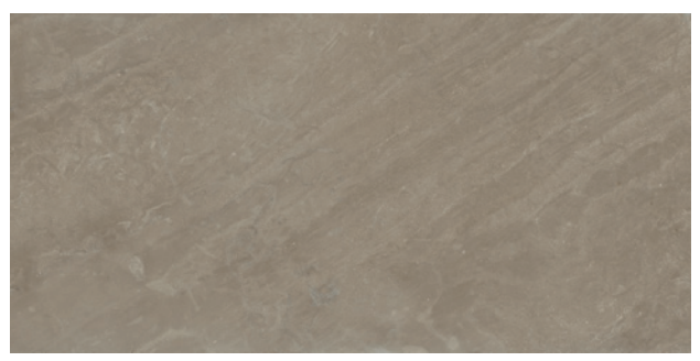
PTG04 ► Tinta Negra