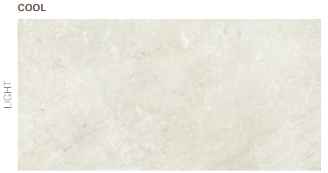
PTG01 ► Velho White