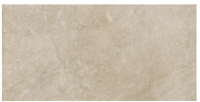
PTG02 ► Grand Rosé