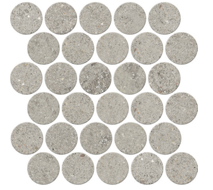
2.5 Diameter Circle Mosaics (available in all colors)