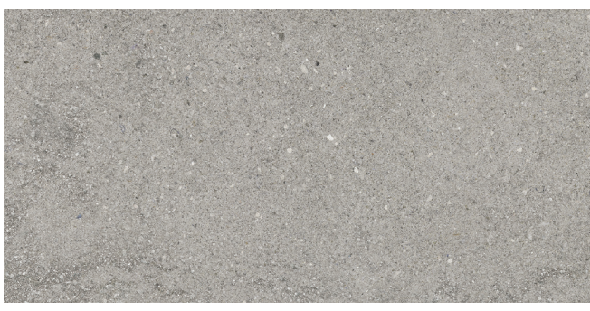
TRY02 ▶ Direction