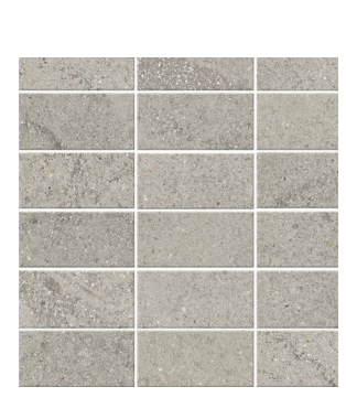
2 x 4 Stacked Mosaics (available in all colors)